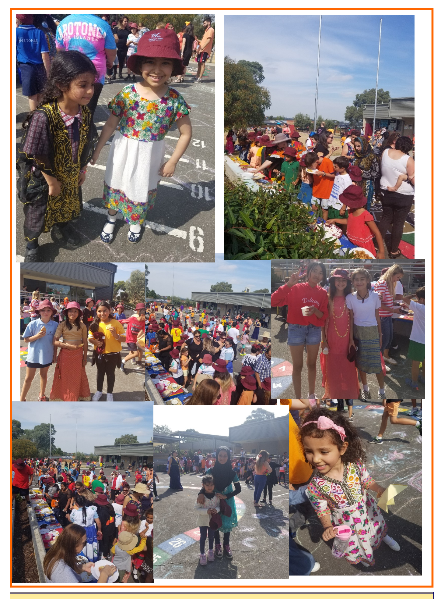
At Reservoir Views Primary School we value: Love of Learning ~ Resilience ~ Respect