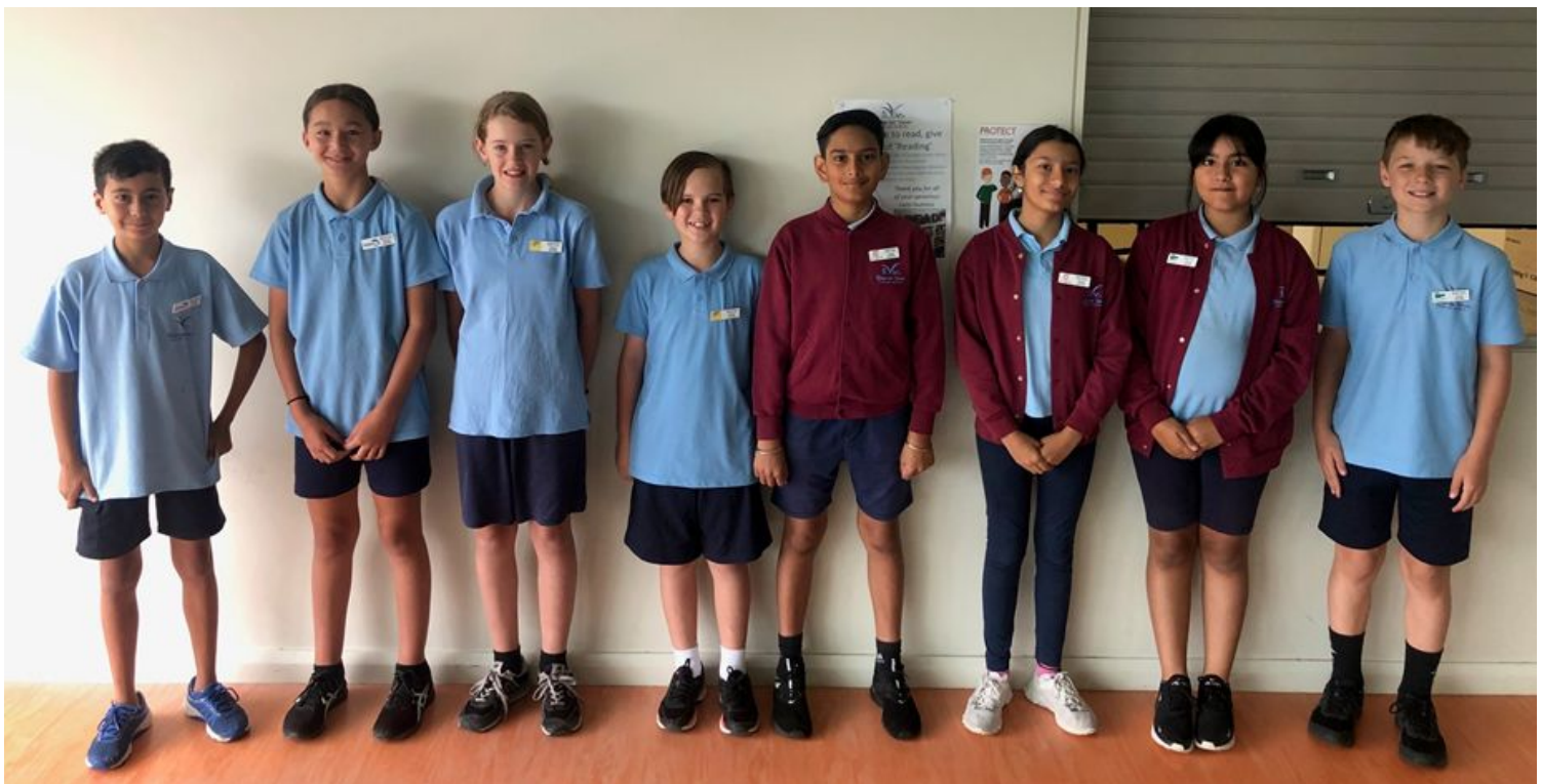
Our House Captains were presented with their leadership badges at this week's assembly.