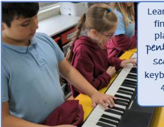
Learning to find and play the pentatonic scale on keyboards in 4/5/6