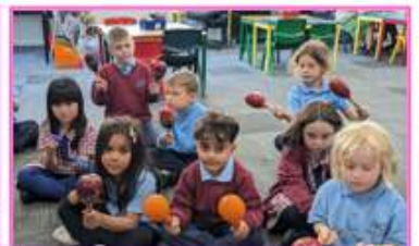
Working on our dynamics by making forte and piano sounds in Foundation and F/1