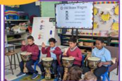
Performing and writing "tikatika" rhythms in 2/3/4