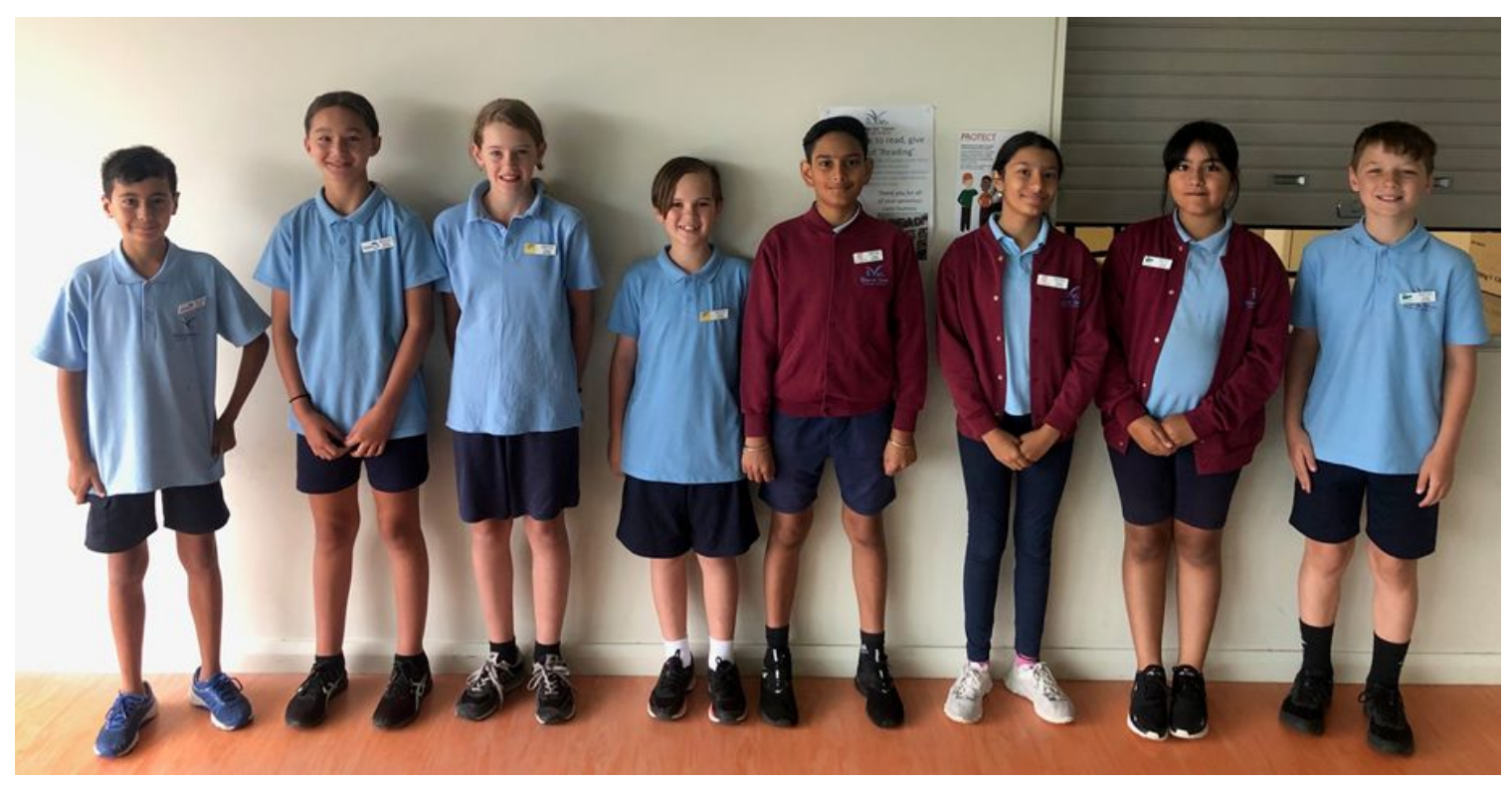
Our House Captains were presented with their leadership badges at this week's assembly.